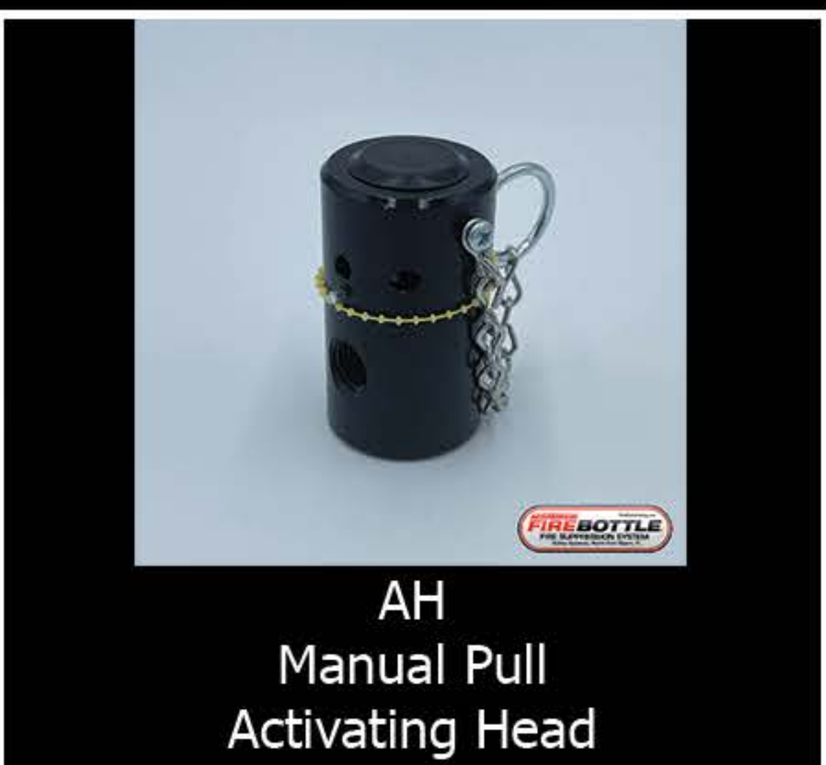
AH Manual Pull Activating Head