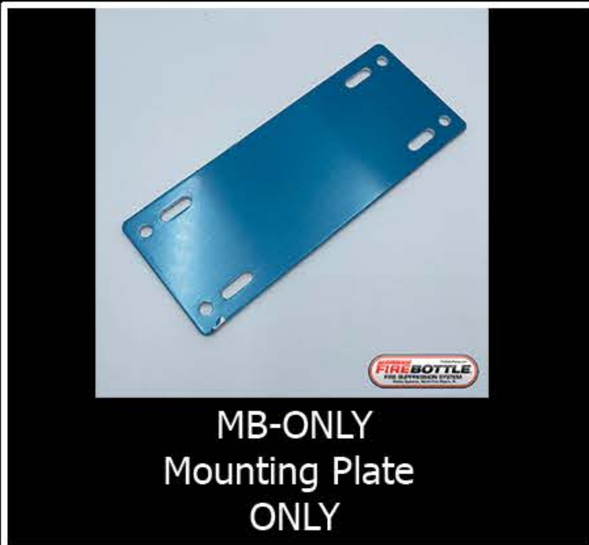
MB-ONLY Mounting Plate ONLY