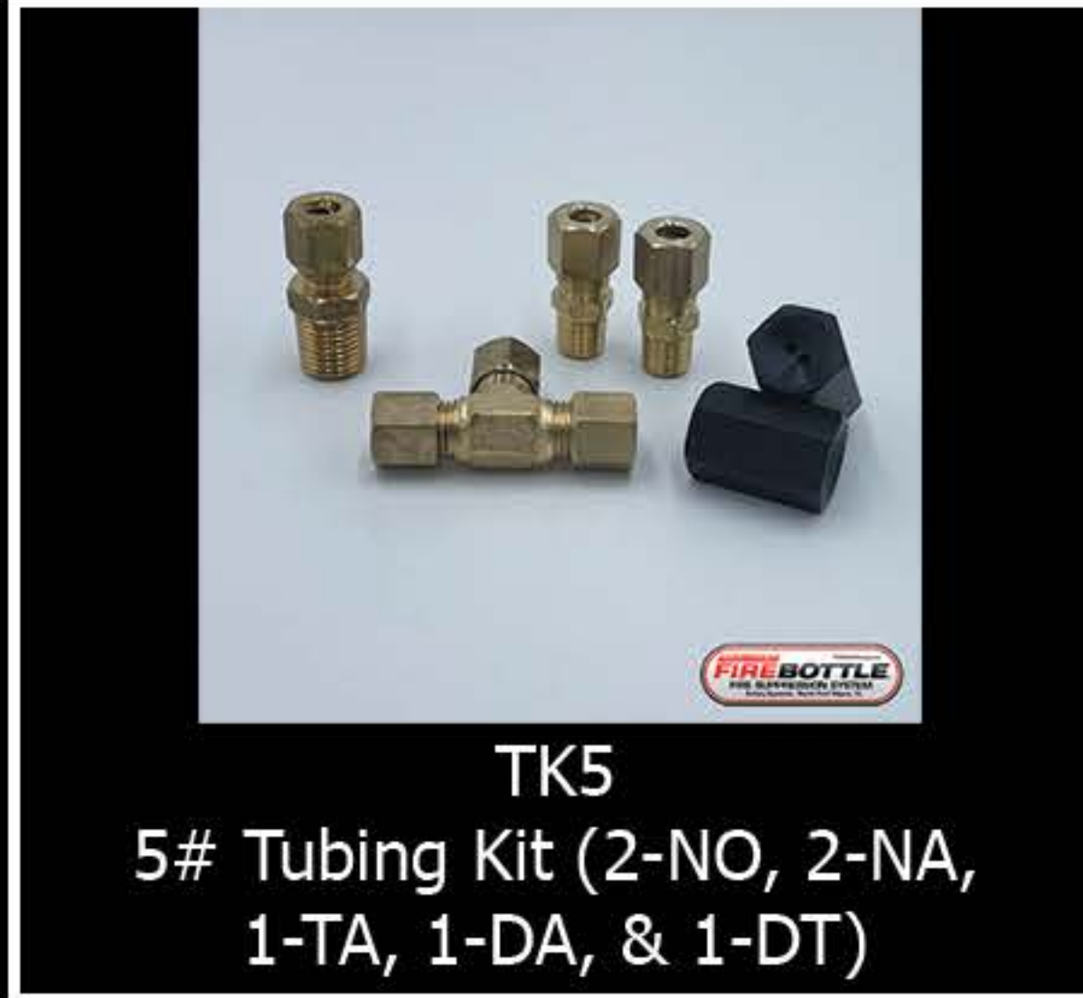
TK5 5# Tubing Kit (2-NO, 2-NA, 1-TA, 1-DA, & 1-DT)