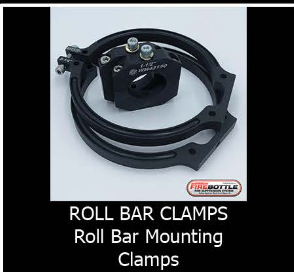
ROLL BAR CLAMPS Roll Bar Mounting Clamps