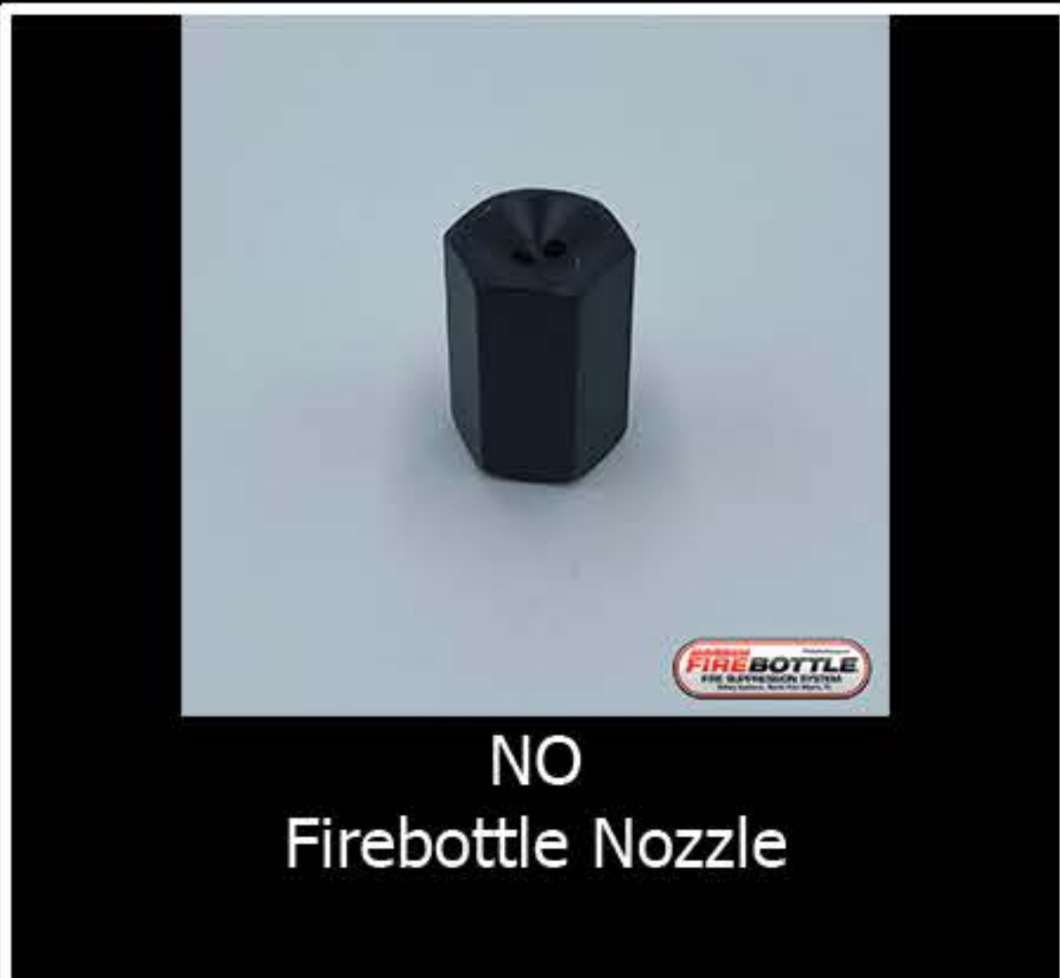
NO Firebottle Nozzle