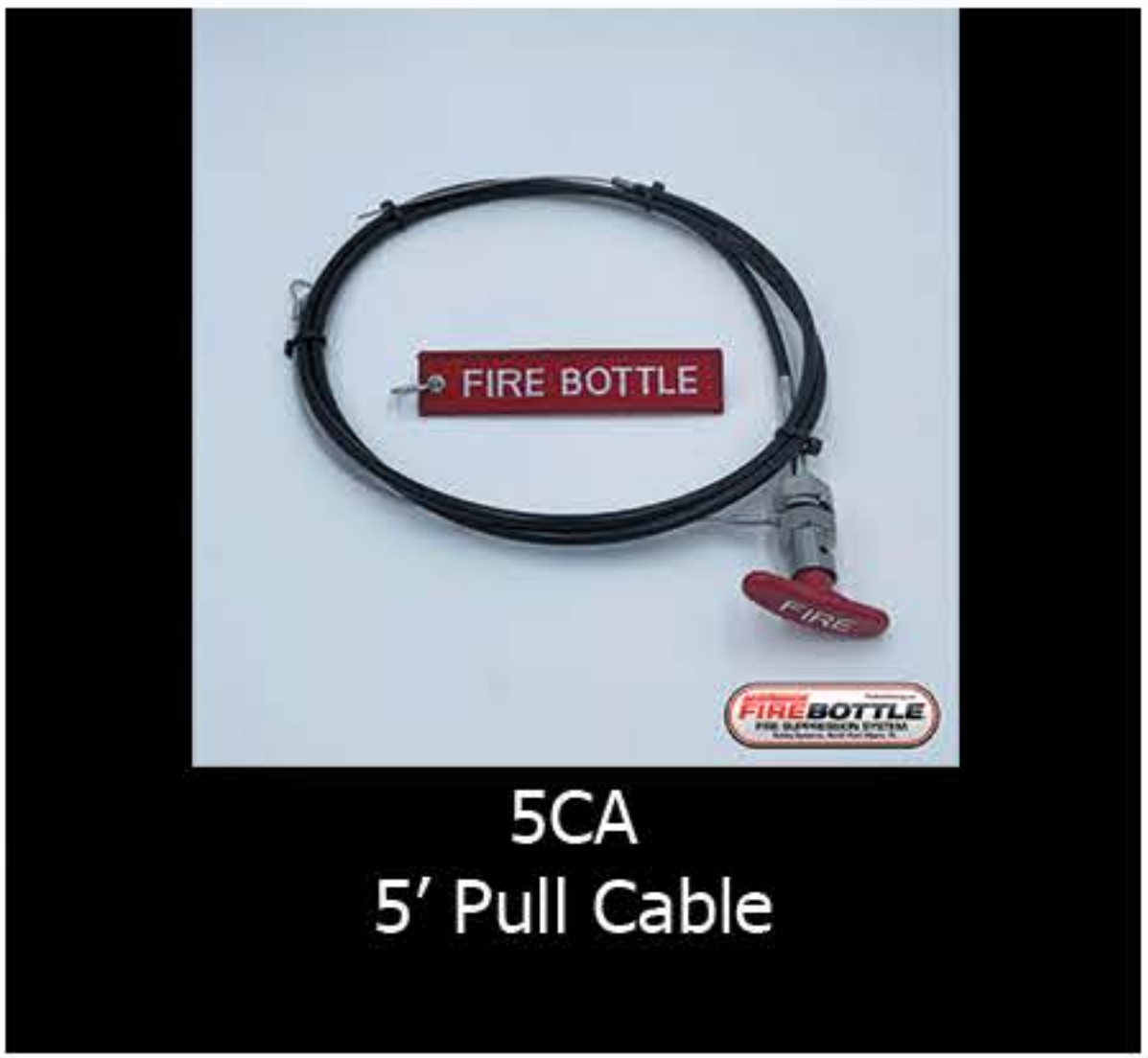
5CA 5' Pull Cable

Safety Systems, Inc 1529 Laurel Drive, N Ft Myers, FL 33917 PH:239.995.6300 FX:239.995.6301 WWW.FIREBOTTLERACING.COM