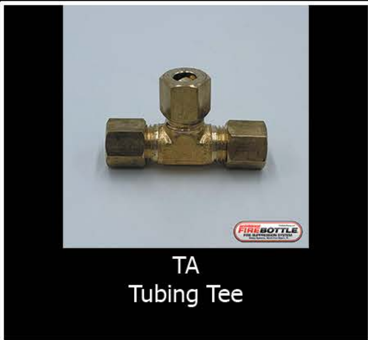
TA Tubing Tee