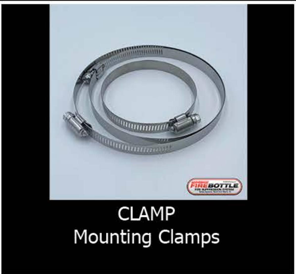
CLAMP Mounting Clamps