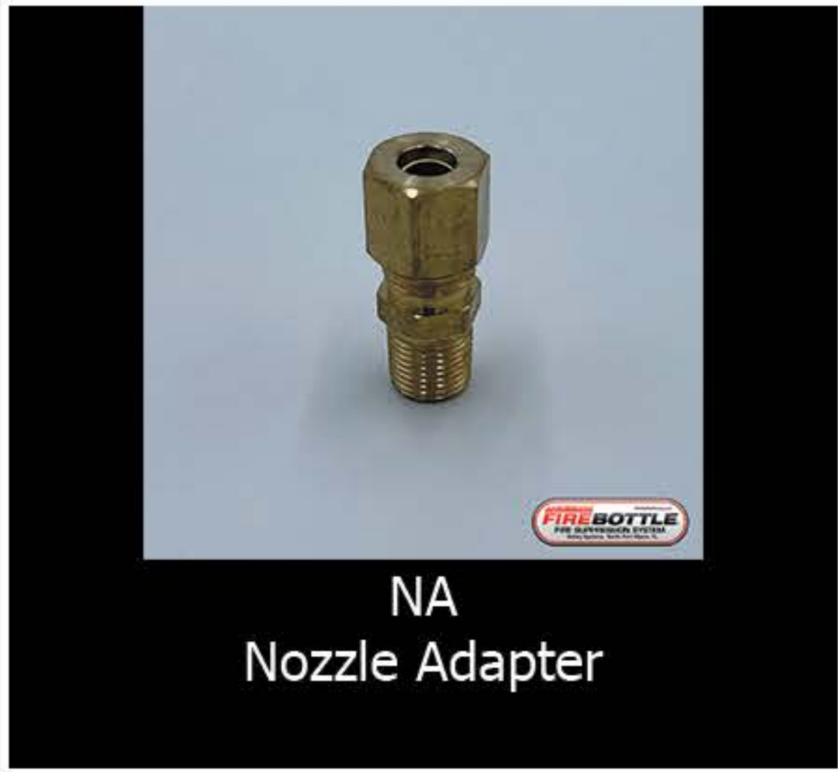
NA Nozzle Adapter

Safety Systems, Inc 1529 Laurel Drive, N Ft Myers, FL 33917 PH:239.995.6300 FX:239.995.6301 WWW.FIREBOTTLERACING.COM