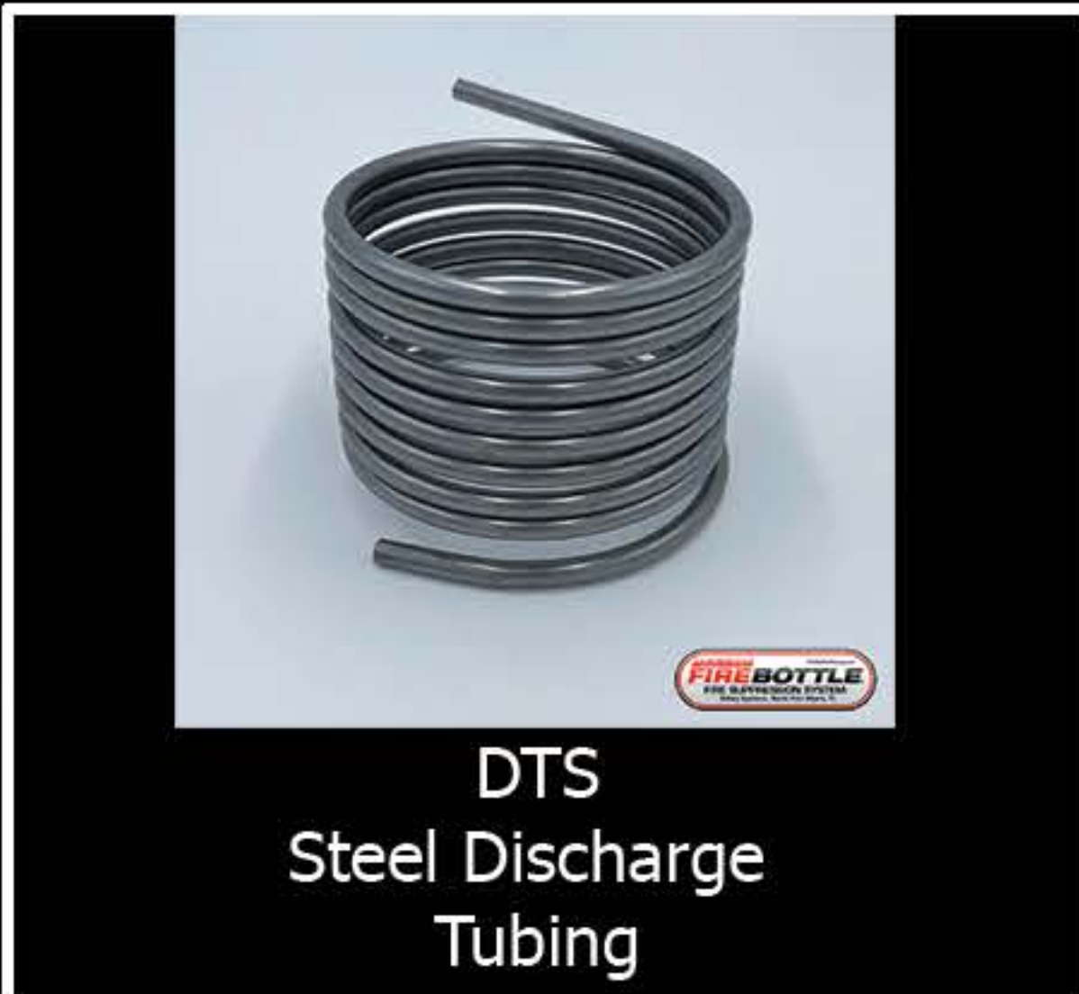
DTS Steel Discharge Tubing