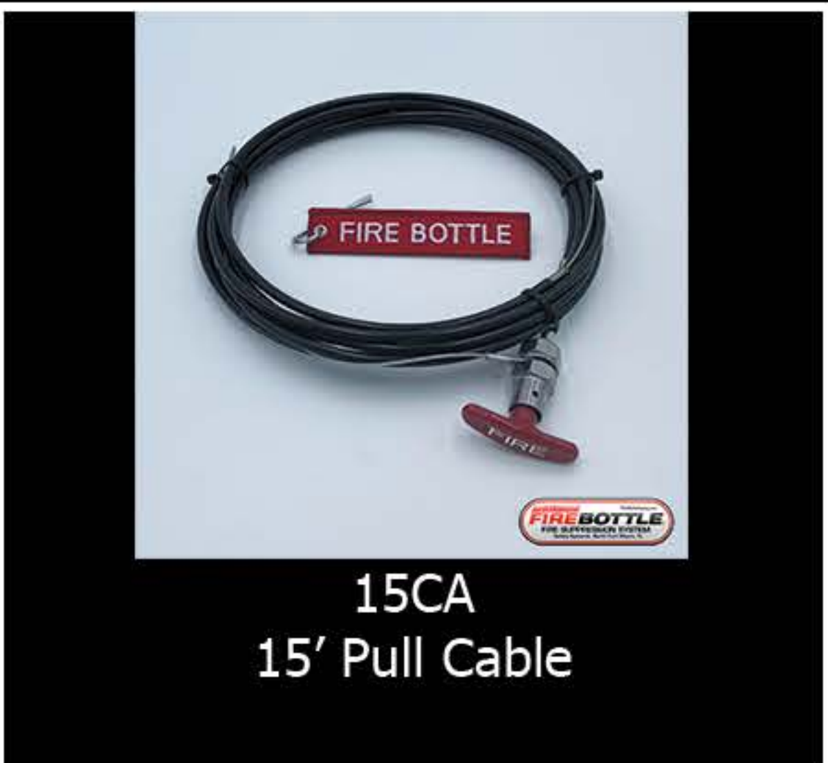
15CA 15' Pull Cable