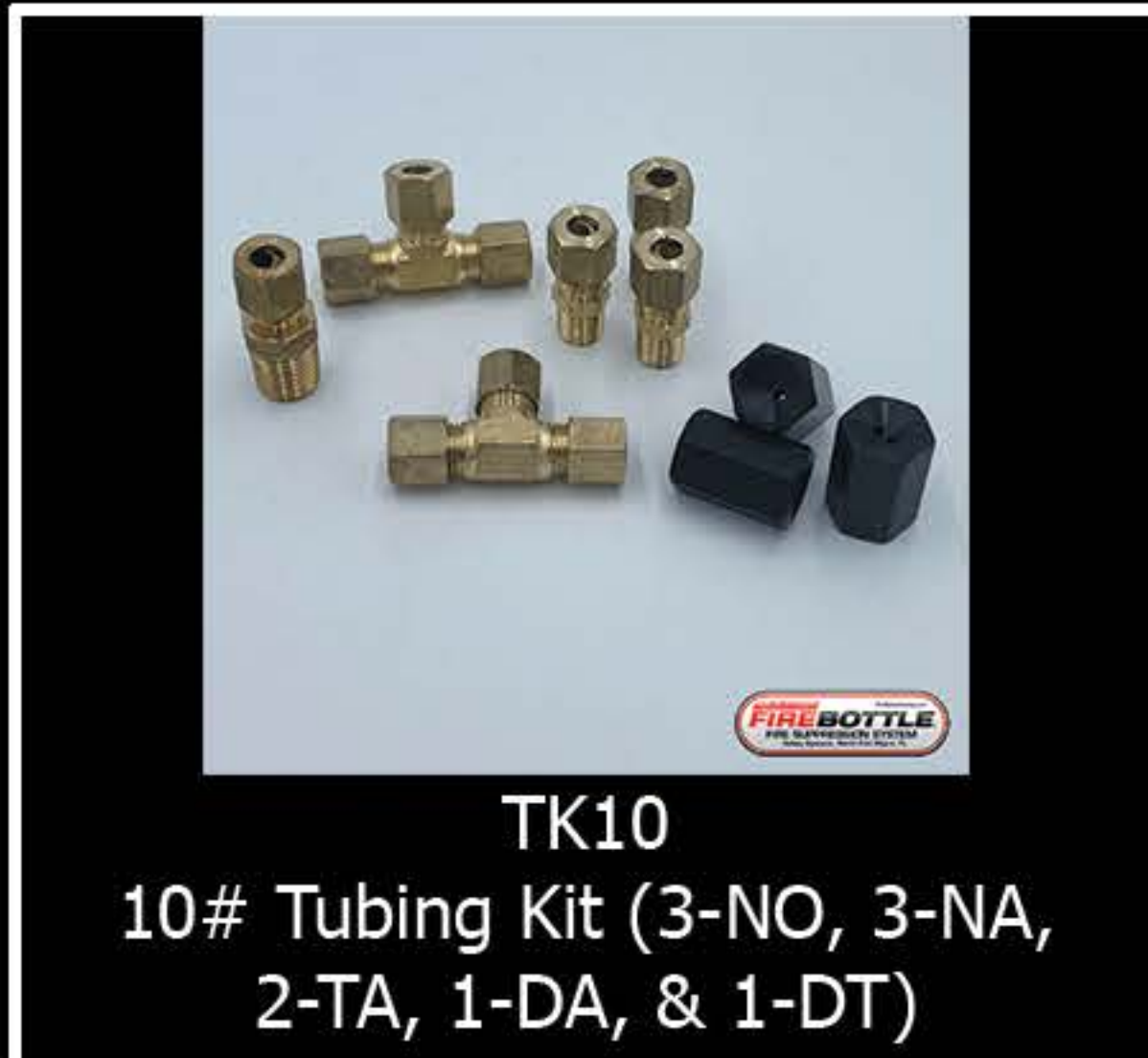
TK10 10# Tubing Kit (3-NO, 3-NA, 2-TA, 1-DA, & 1-DT)