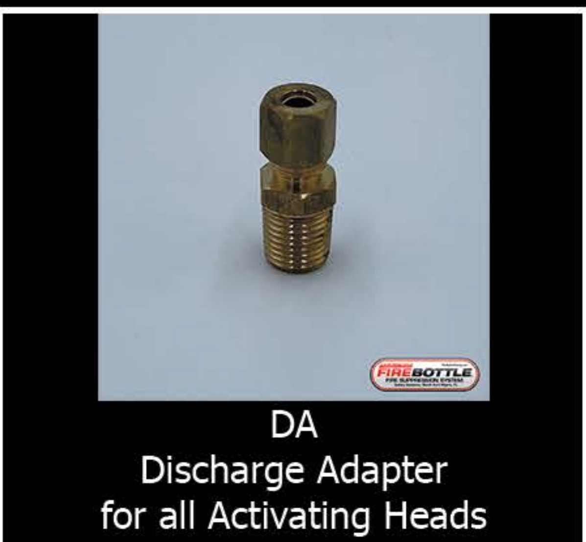
DA Discharge Adapter for all Activating Heads