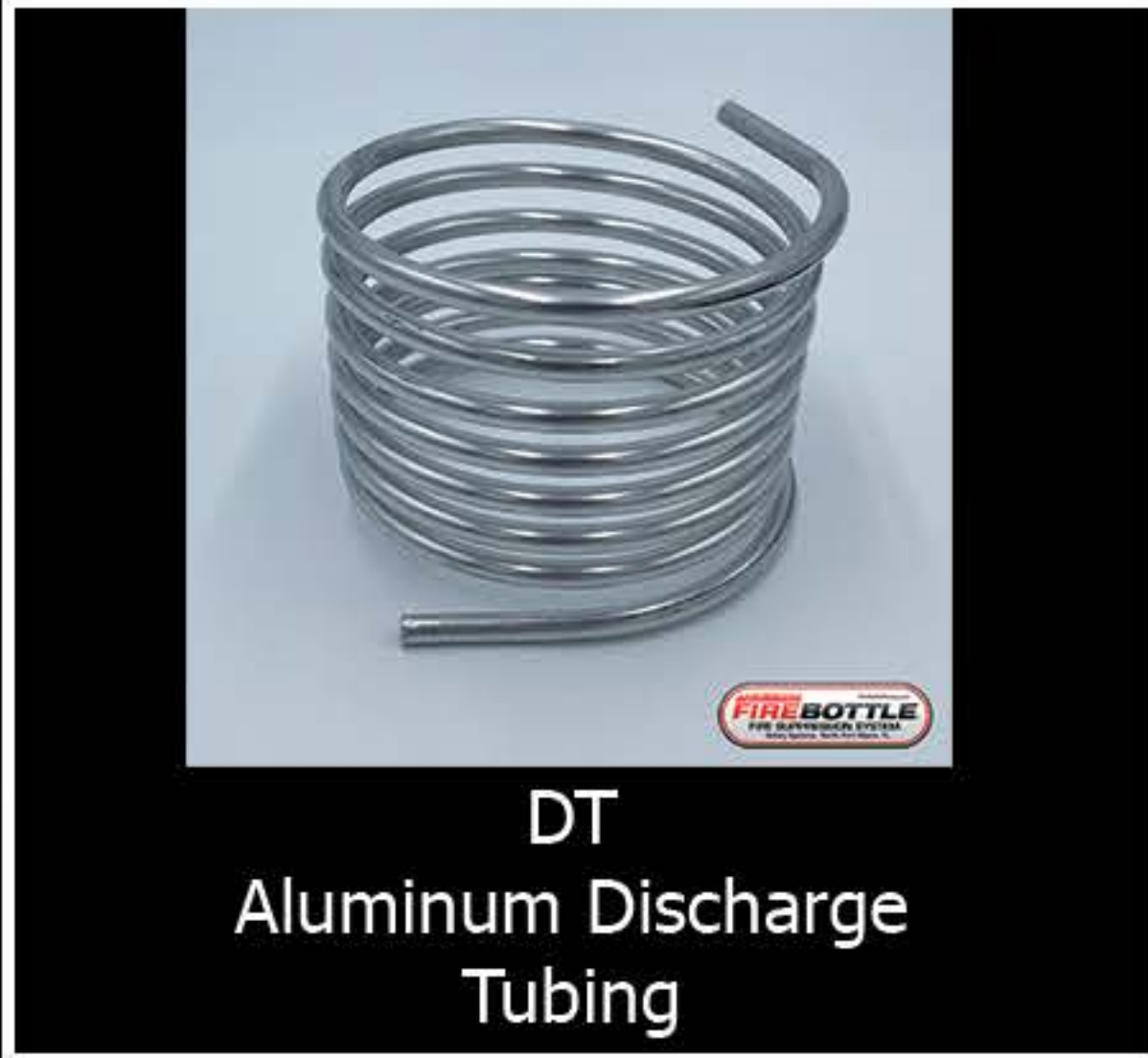
DT Aluminum Discharge Tubing